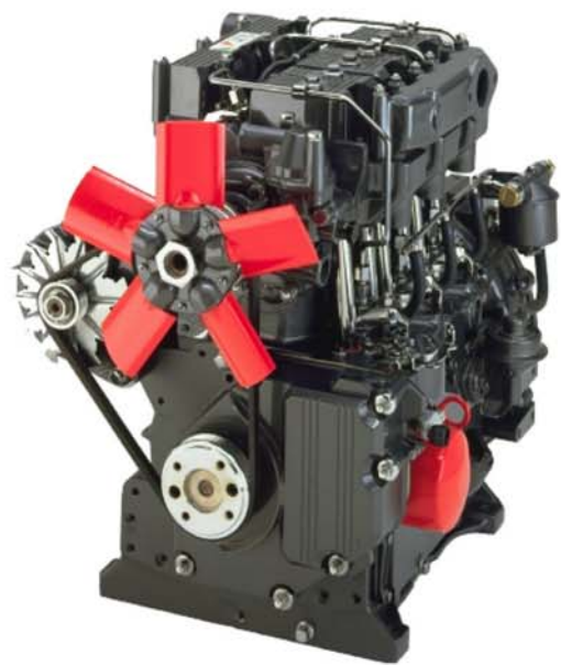
ALPHA SERIES Eng In E